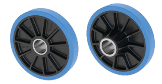
faigle shows mechanical engineers new ways to reduce weight and costs by using plastic.

Taking into account the requirements for the various components, faigle worked with TGW to draw up a concept that highlighted potential improvements. In development processes like this, the emphasis is always on the entire application – both the shuttle in operation and as part of the overall system. For instance, the loads to which individual components are exposed, the ambient temperature in which they operate, their service life and other factors are all examined. But maximising plant availability is always the overriding focus of the analysis.