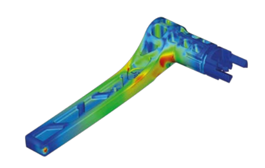
The flap is light, highly resilient and durable, and also helps to reduce manufacturing costs and shorten delivery times.

Based on the results of the analysis, the plastics experts identified two starting points from which they could further enhance the TGW shuttle's effi ciency. faigle developed special shuttle wheels as well as new shuttle fl aps, both made from plastic.